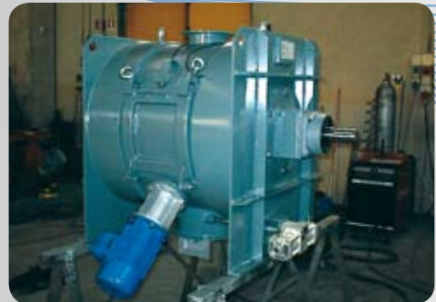
Con frullino / Chopper