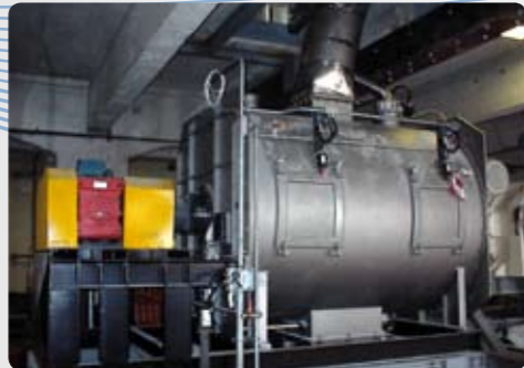
AISI 316 / SS 316