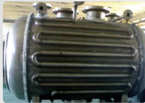
Riscaldamento esterno External heating