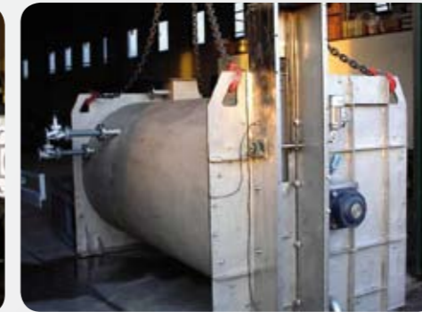
Scarico regolabile Adjustable discharge