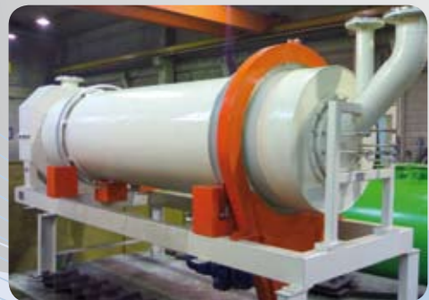
Continuo / Continuous