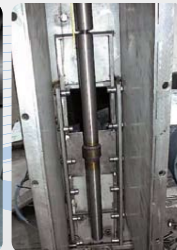
Scarico regolabile Adjustable discharge