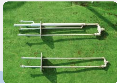
Lancia liquidi / Lance for liquid