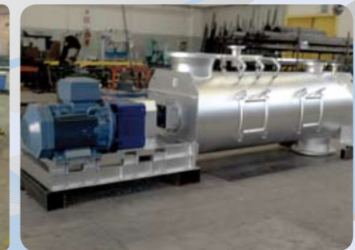
Carboni attivi Activated carbon