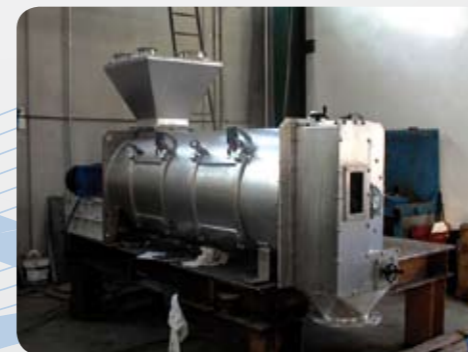
Scarico regolabile Adjustable discharge

a vomeri Continuo / Continuous plough share mixer