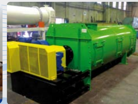
Bonifica terreni Sludge treatment