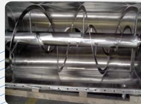
Vista interna Internal