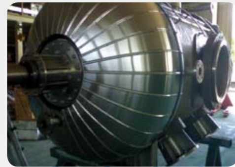
Tenuta meccanica Mechanical seal