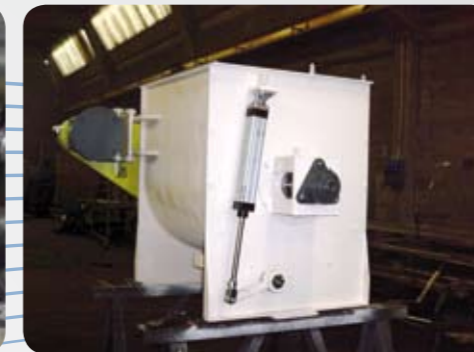
Vista esterna External