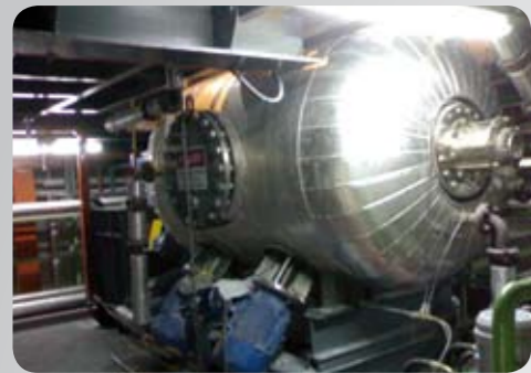
20 bar, 220° C tenute meccaniche Mechanical seal