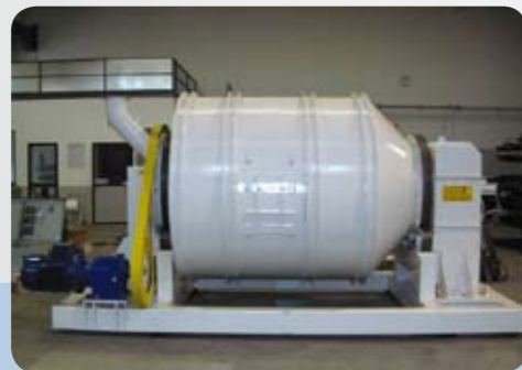
Discontinuo / Discontinuous