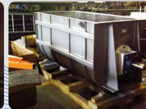
Sezione a "U" "U" section